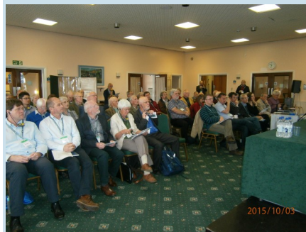
Delegates gather for the meeting.