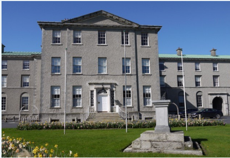
St Patrick's College