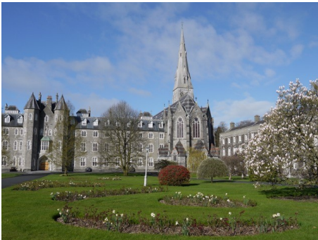
St Patrick's College