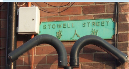
Street sign in Chinatown