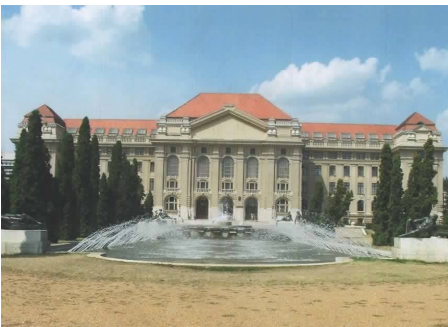
University of Debrecan

The 25th Congress of Onomastic Sciences will take place this year at Debrecan in Hungary, from 27 August to 1 September. By the time you receive this newsletter the programme is due to have been finalized and online registration will have opened.