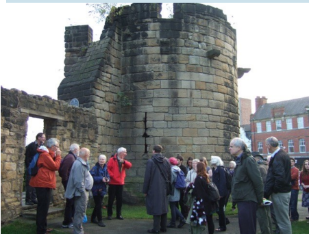
At the town wall