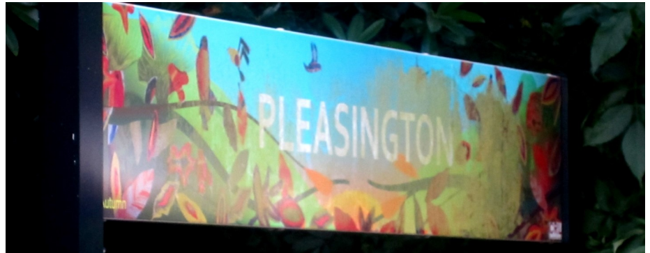
A colourful and pleasing Pleasington sign in Lancs.