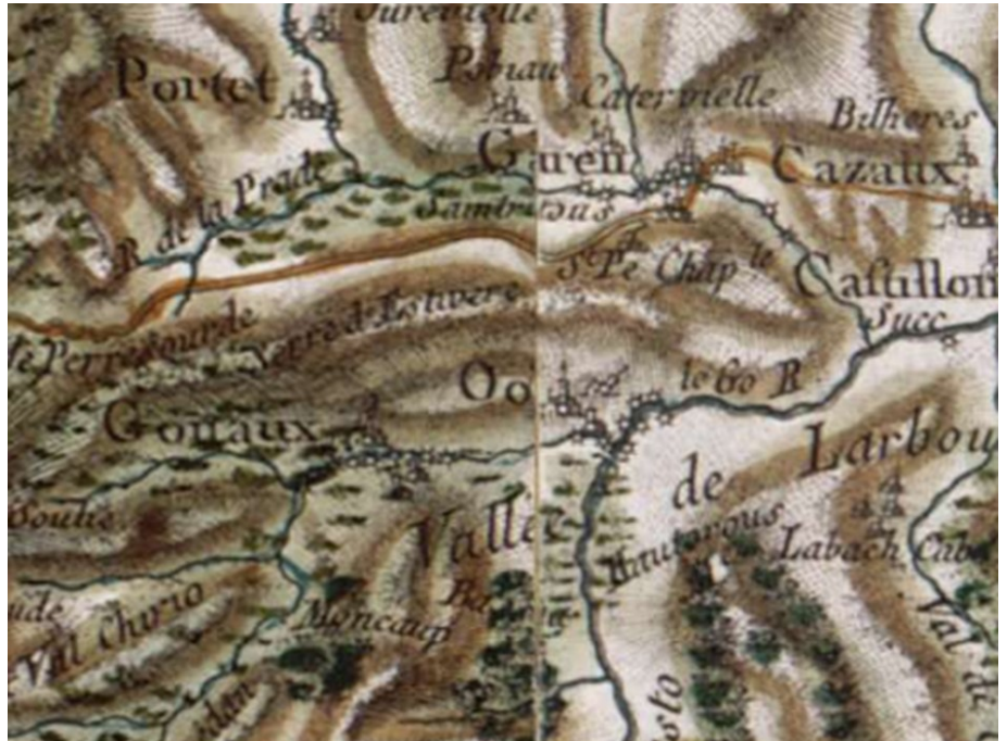
Figure 2: Oô (départ. Haute-Garonne) on the eighteenth-century map of Cassini. It is 5 kilometres west of Bagnères-de-Luchon. From http://cassini.ehess.fr/cassini/fr/ .

13 Reinhold Möller, Niedersächsische Siedlungsnamen und Flurnamen in Zeugnissen vor dem Jahre 1200 . Ed. Rudolf Schützeichel. Bd. 16. Beiträge zur Namenforschung. Heidelberg: Carl Winter, 1979, pp. 33–34.