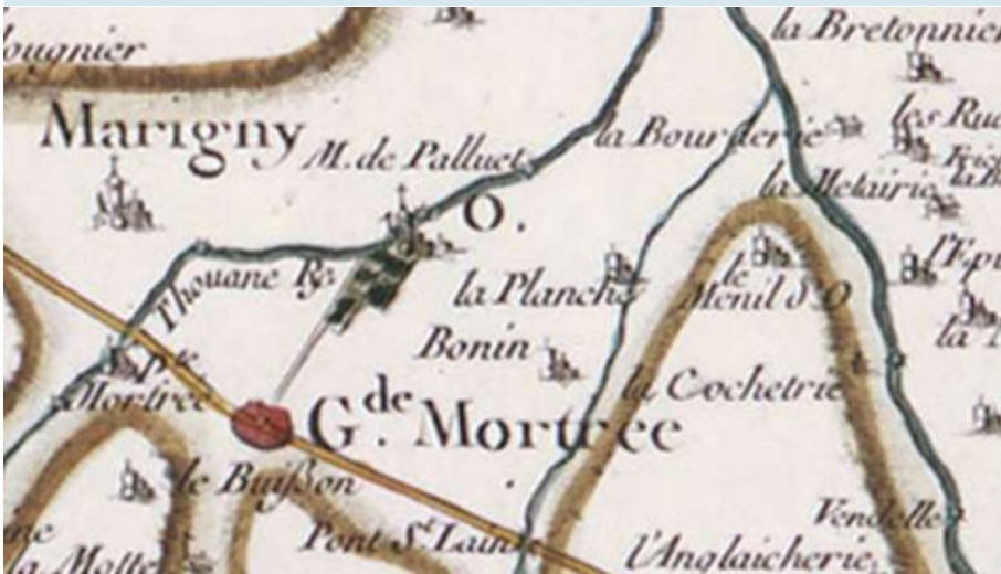
Figure 1: O near Mortrée (département Orne) on the eighteenth-century map of Cassini. From http://cassini.ehess.fr/cassini/fr/ .

Guyotjeannin [7] identifies villa que dicitur Iei therein as “peut-être Y”. This looks likely despite the form Iei being mysterious, as the region is appropriate and no other candidate is known. But if this identification is incorrect, then the name may not be old, and could just refer to the Y-shaped junction of three roads at the centre of the village. See Figure 3.