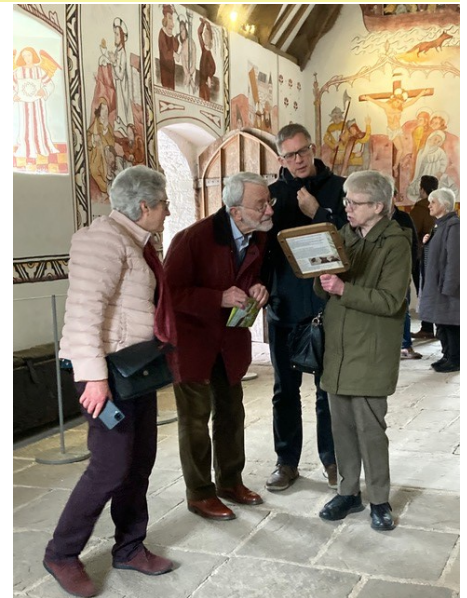
Delegates enjoying the excursion to St Fagans