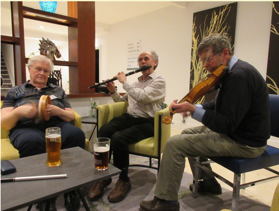
Music in the hotel bar