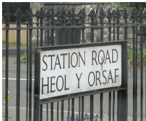
("Heol Y Orsaf" should be "Heol Yr Orsaf")