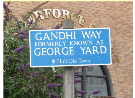
Gandhi Way, a renaming of George Yard, Kingston upon Hull