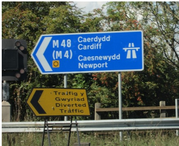
("Caesnewydd" should be "Casnewydd")