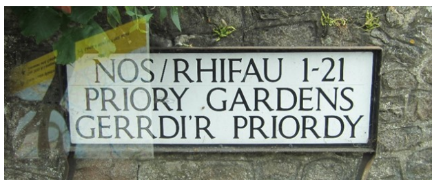
("Gerddi'r Priordy" should be "Gerddi'r Priordy")